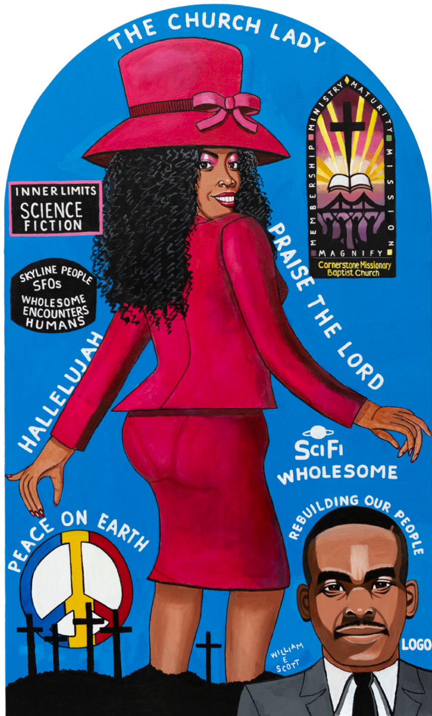
William Scott Untitled (WS 560) , 2021 Acrylic on canvas 36x60x1.5 inches