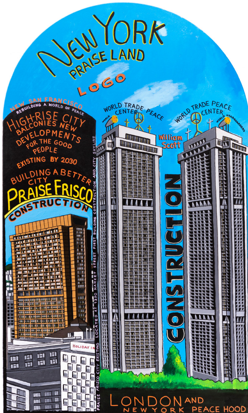
William Scott Untitled (WS 558), 2021 Acrylic on canvas 36x60x1.5 inches