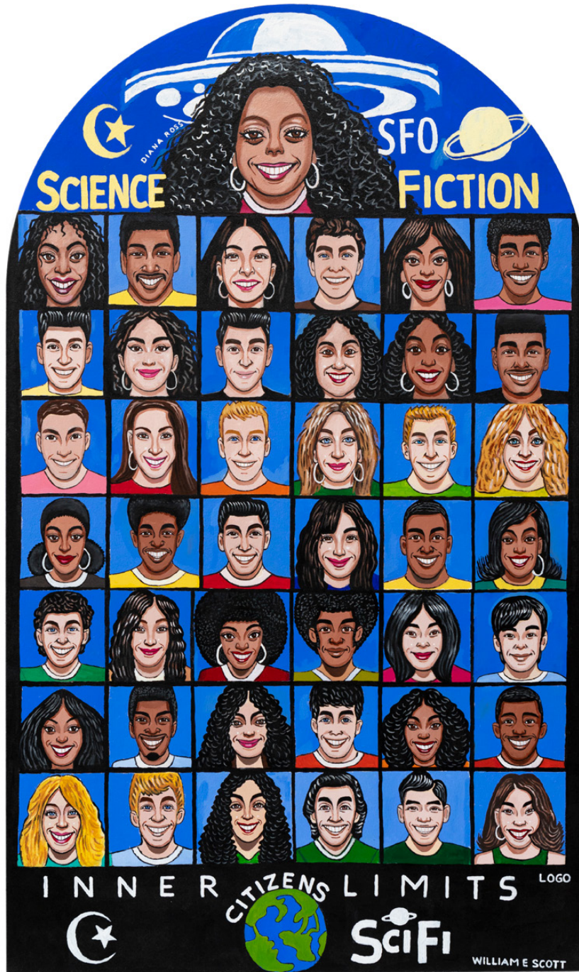
William Scott Untitled (WS 559), 2021 Acrylic on canvas 36x60x1.5 inches