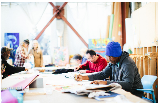
Artists working in the Creative Growth Studio

The Gallery exhibits artwork by Creative Growth artists, and increases their visibility in the contemporary art world by placing their work in major collections and institutions worldwide. Artwork sales directly support the artists and Creative Growth.