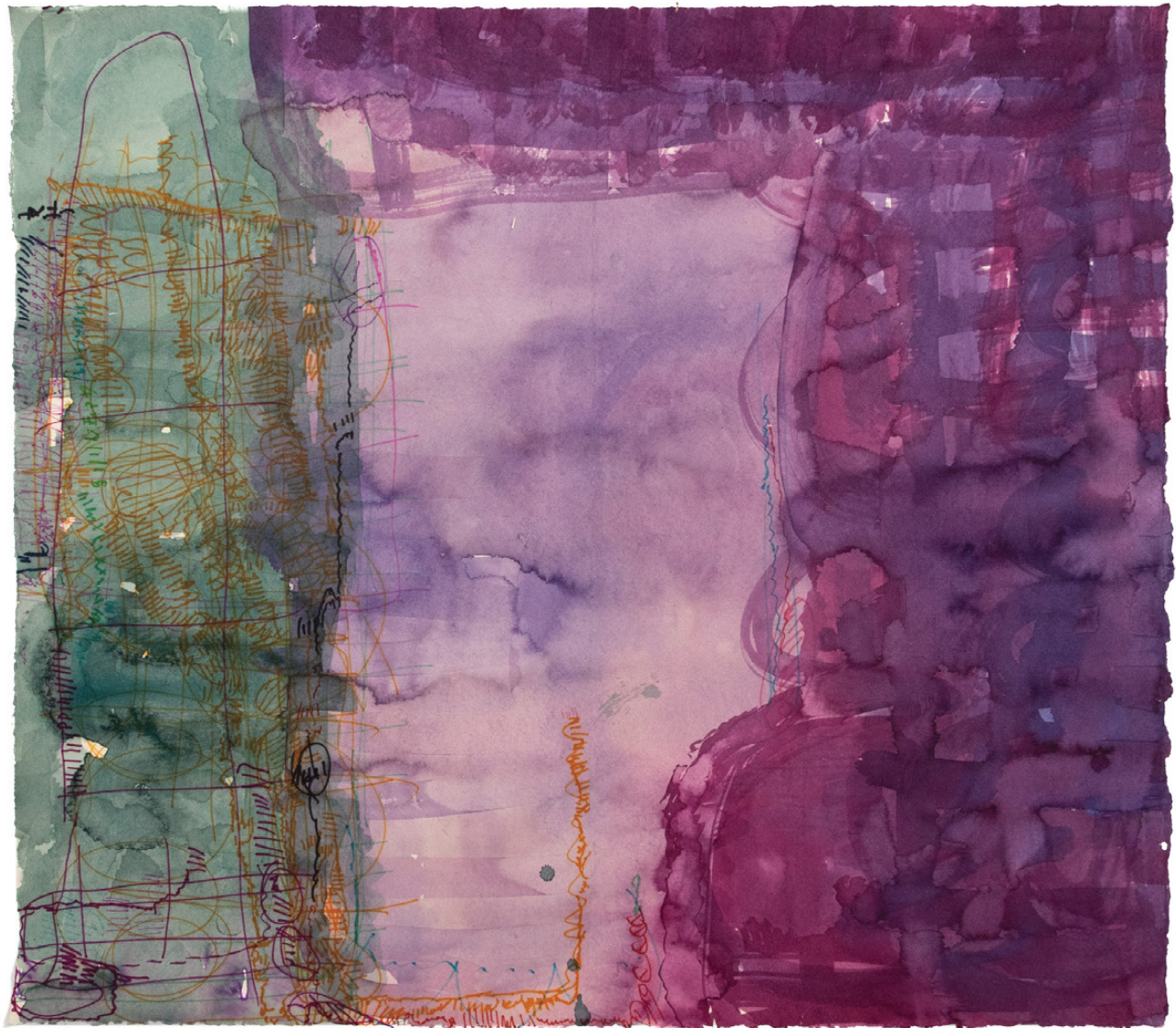
Nicole Storm NS 091 (ND) Acrylic and ink on paper 21x23.75 inches