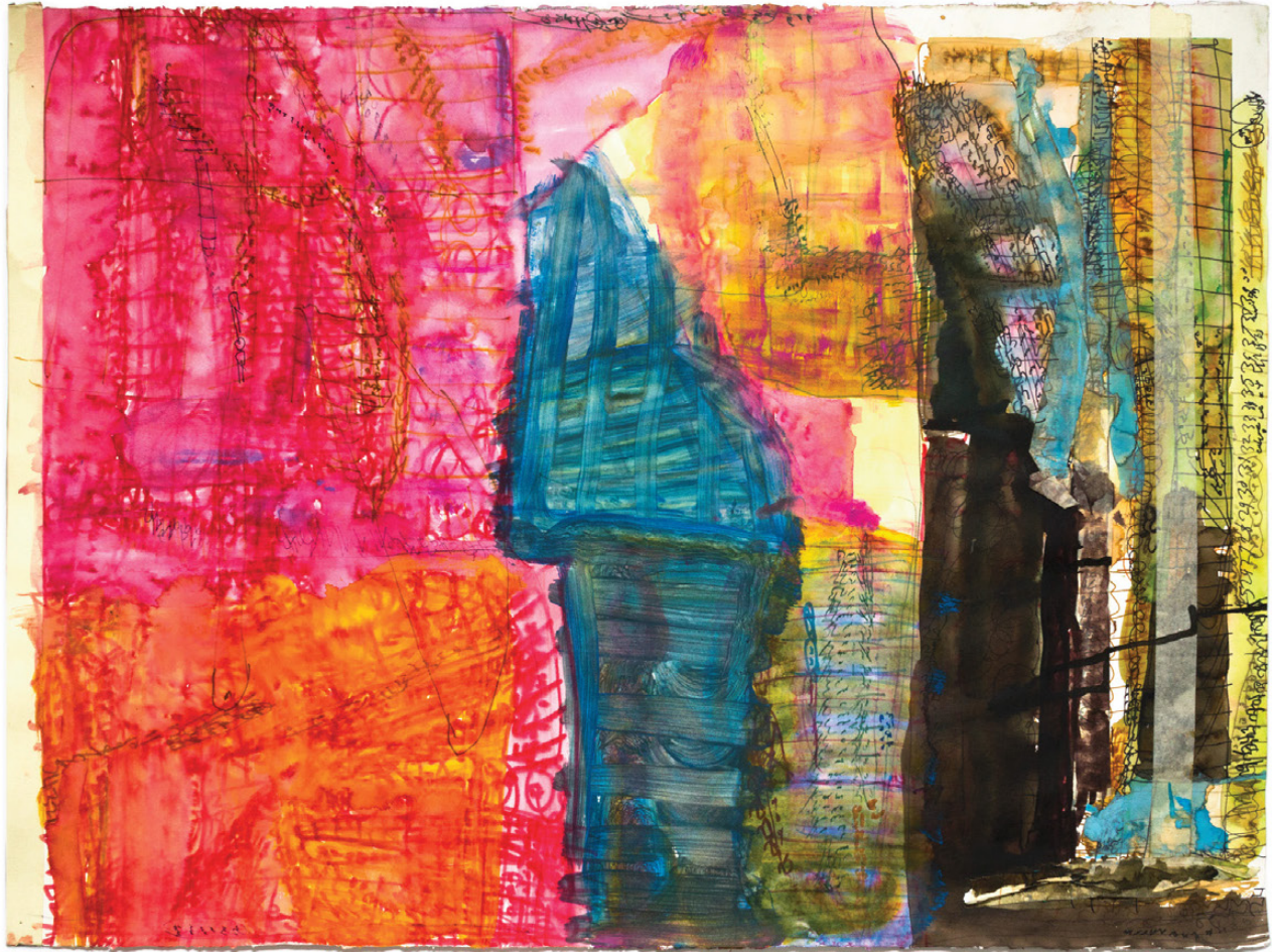
Nicole Storm NS 62 (2018) Mixed media on paper 22.25x30 inches